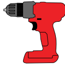
Phillips Screw Driver