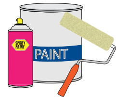
Spray Paint or Paint + Roller