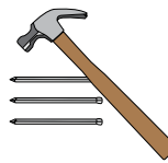
Hammer + Nails