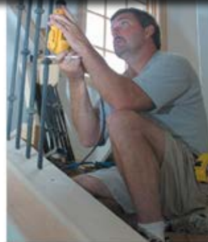
3. Cut round hole in bottom of handrail for baluster.