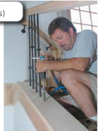
4. Square off bottom hole with air hammer/chisel and mortising bit without the drill inside. (For installation of square balusters without needing shoes)