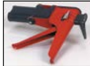
PCA-EG EPOXY GUN