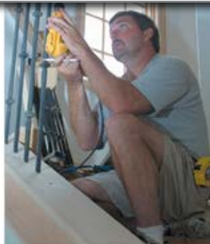
3. Cut round hole in bottom of handrail for baluster.