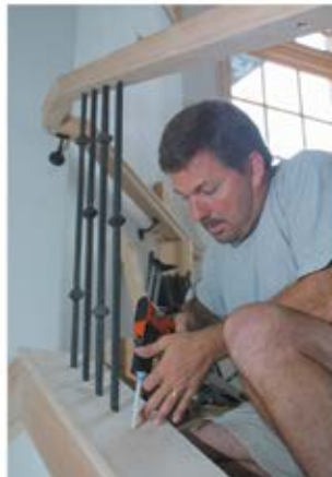
6. Do same for bottom.