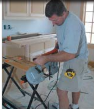
2. Cut baluster to length.