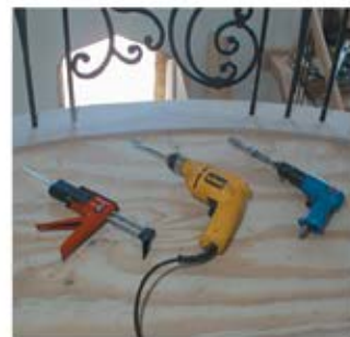
TOOLS USED: Standard Electric Drill, Air Hammer/Chisel, Epoxy Gun

Powder Coated Wrought Iron and Wood Newel Posts ordered in error may be returned (Freight Pre-paid) for credit within 30 days less a 30% restocking charge.