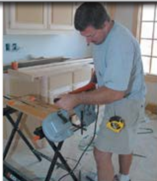
2. Cut baluster to length.