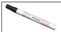
PCA-TUP-SB Satin Black * Touch Up Pen * Touch up paints available in Black only