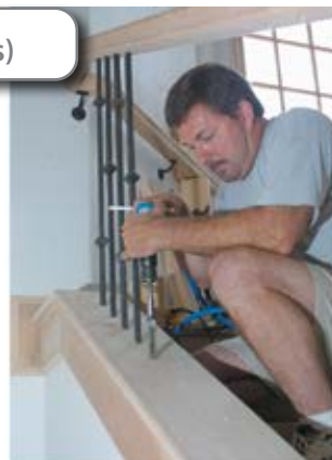
4. Square off bottom hole with air hammer/chisel and mortising bit without the drill inside. (For installation of square balusters without needing shoes)