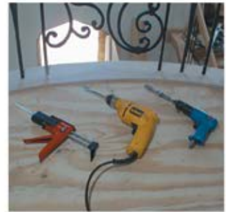
TOOLS USED: Standard Electric Drill, Air Hammer/Chisel, Epoxy Gun

Powder Coated Wrought Iron and Wood Newel Posts ordered in error may be returned (Freight Pre-paid) for credit within 30 days less a 30% restocking charge.