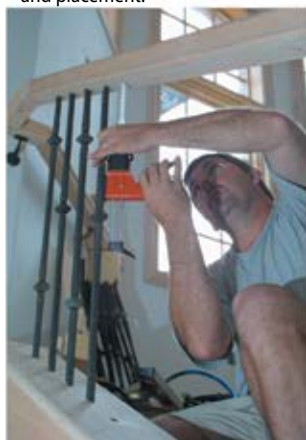
5. Apply epoxy in hole for baluster on top.