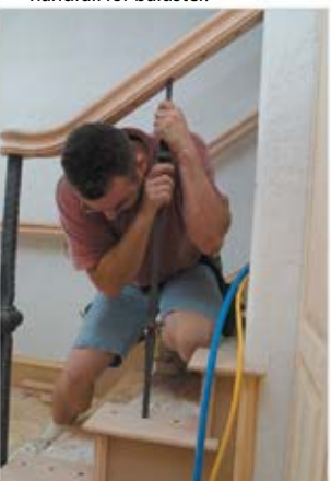
7. Install baluster into epoxy filled holes and press in for tight fit.