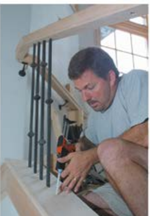
6. Do same for bottom.