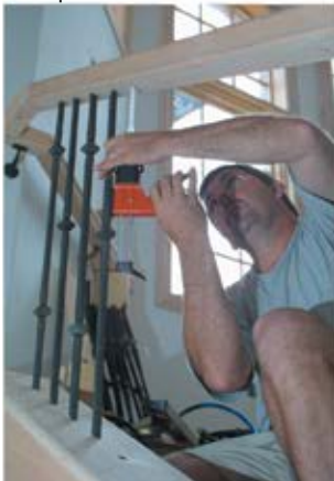
5. Apply epoxy in hole for baluster on top.