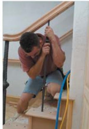
7. Install baluster into epoxy filled holes and press in for tight fit.