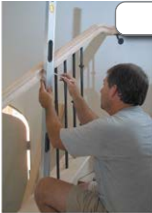
1. Check for plumb of baluster length and placement.