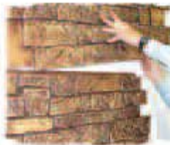
4. Insert flat panel edge into groove at top edge.