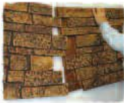
2. Glue back and slide next piece in.