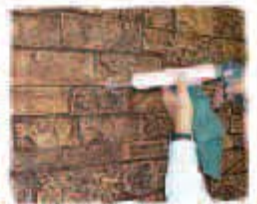
10. Caulk seams to finish.