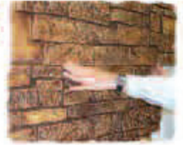
5. Tap in for snug fit.