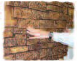
5. Tap in for snug fit.