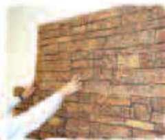
9. Continue to glue, fit, and fasten.