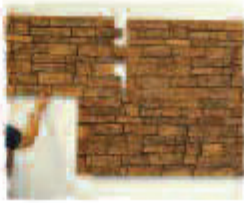
7. Keep each panel to level line.