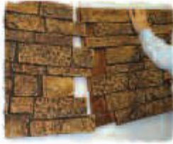
2. Glue back and slide next piece in.