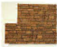
6. Offset each row by one half sheet.