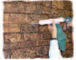
10. Caulk seams to finish.