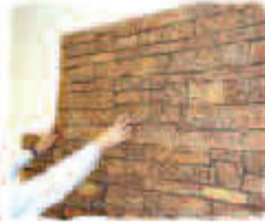
9. Continue to glue, fit, and fasten.