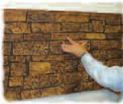
3. Tap in for snug fit.