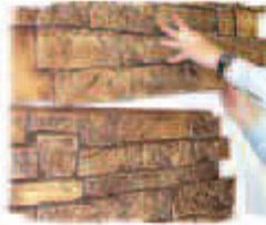
4. Insert flat panel edge into groove at top edge.