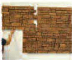
7. Keep each panel to level line.