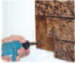
1. Glue back and fasten with screws on level.

Be sure that the tongue portion of the panel is on top of the panel, groove portion on the bottom. Slide the adjoining panel into the interlocking groove, then glue and screw in place. Repeat until the row is complete. To begin the next row, offset the next row by ½ sheet to provide a more seamless effect. Follow finishing instructions below.