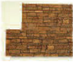
6. Offset each row by one half sheet.