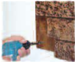
1. Glue back and fasten with screws on level.

Be sure that the tongue portion of the panel is on top of the panel, groove portion on the bottom. Slide the adjoining panel into the interlocking groove, then glue and screw in place. Repeat until the row is complete. To begin the next row, offset the next row by \frac{1}{2} sheet to provide a more seamless effect. Follow finishing instructions below.