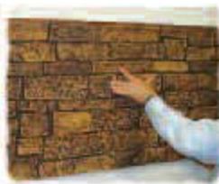
3. Tap in for snug fit.