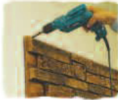
8. Be sure to fasten all corners and edge.