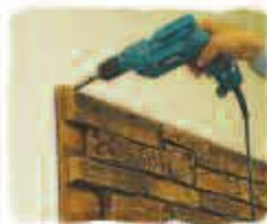
8. Be sure to fasten all corners and edge.