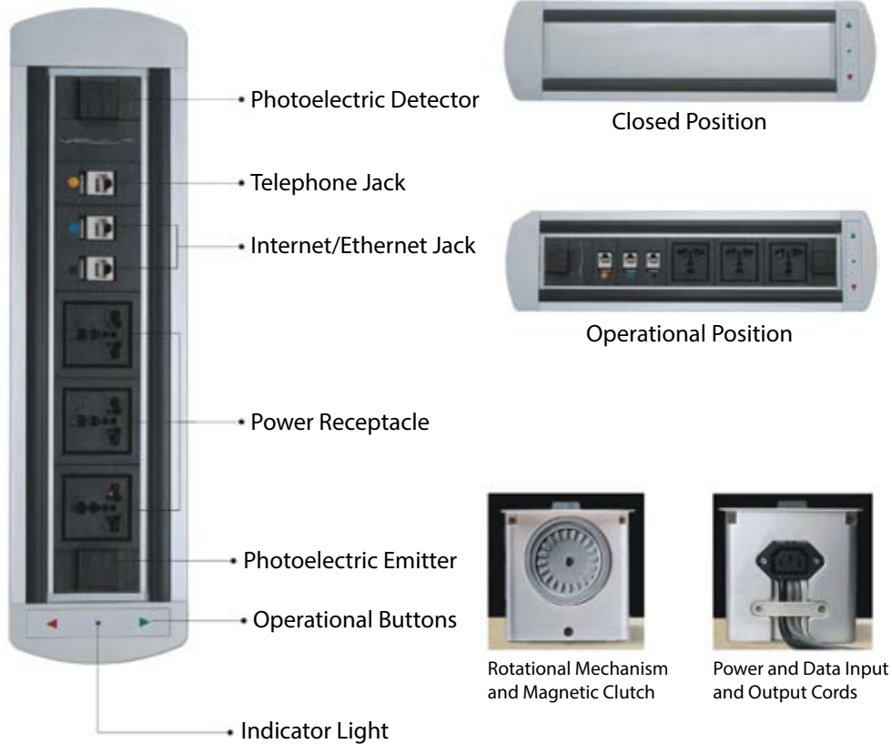
Vault during rotation