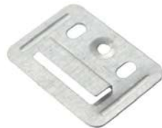
Clip (Sold Separately)