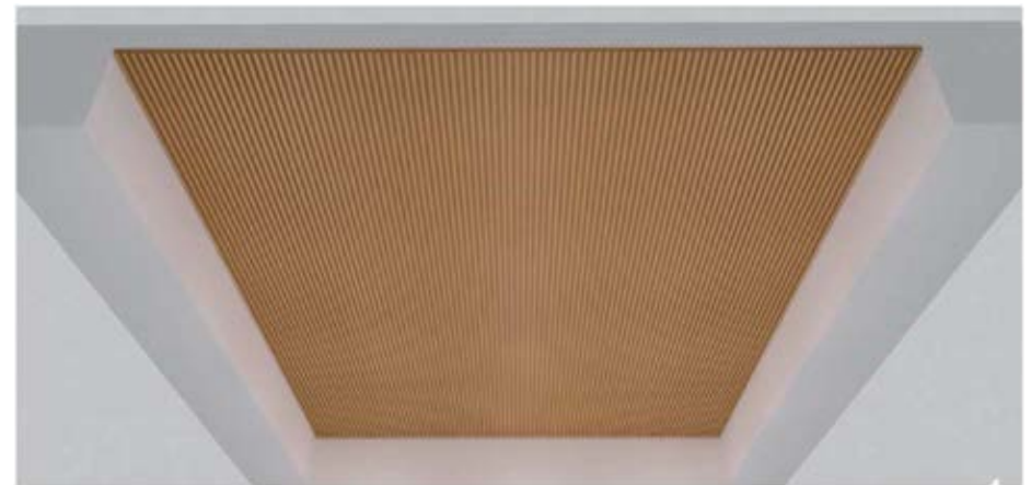
Step Six: Continue adding panels until the installation is complete.