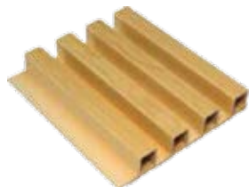
Fluted Wall Panel