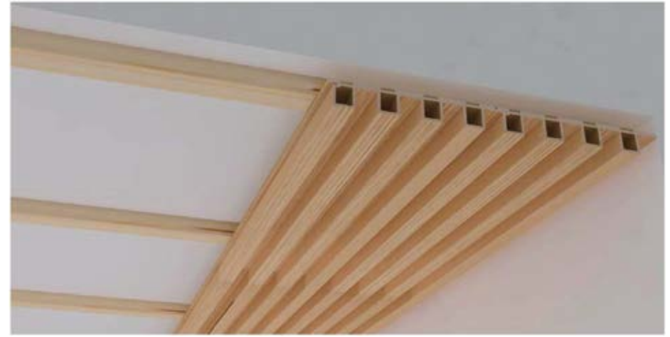
Step Five: The second panel is now joined.