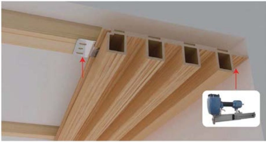
Step Three: Attach the panel to the ceiling with the clip and nail gun.