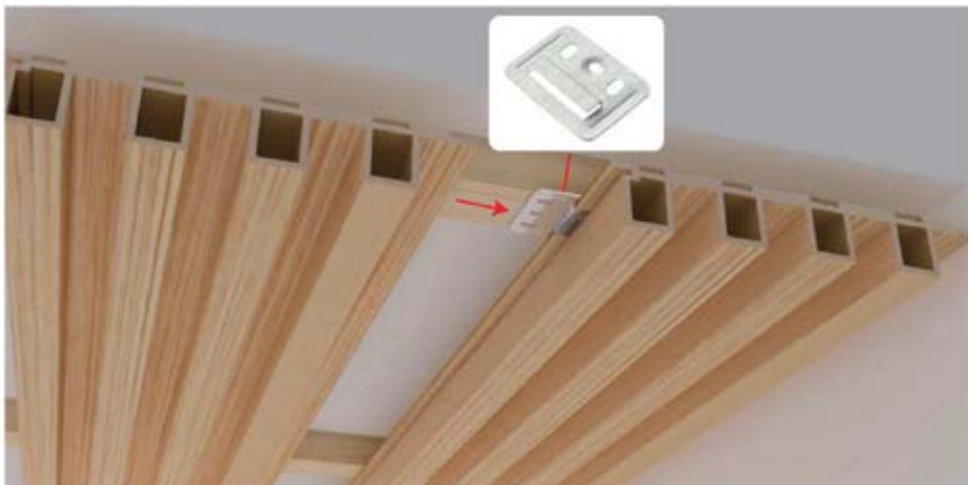
Step Four: Attach the next panel into the card slot on first.